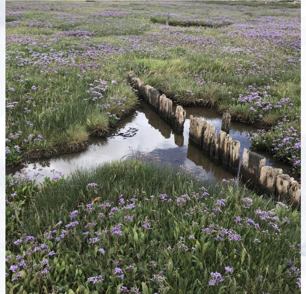
Greatham Sea Lavender

Embodied Connections Conversation Series is a programme of walking and moving conversations in photography across local nature spaces in Hartlepool involving women and gender non-conforming artists and photographers. Responding to the notion of embodied nature-based photographic practice ( the creation or generation of photographic imagery of the natural landscape from the natural landscape ) participants are invited to engage in walking/moving conversations through the natural landscape of Hartlepool exploring plant-based photographic image-making (anthotypes) in collaboration with other photographic mediums.