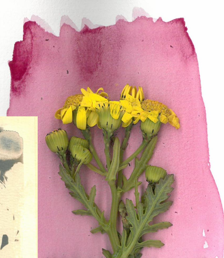
Anthotype preparation (plant-based emulsions and toners)